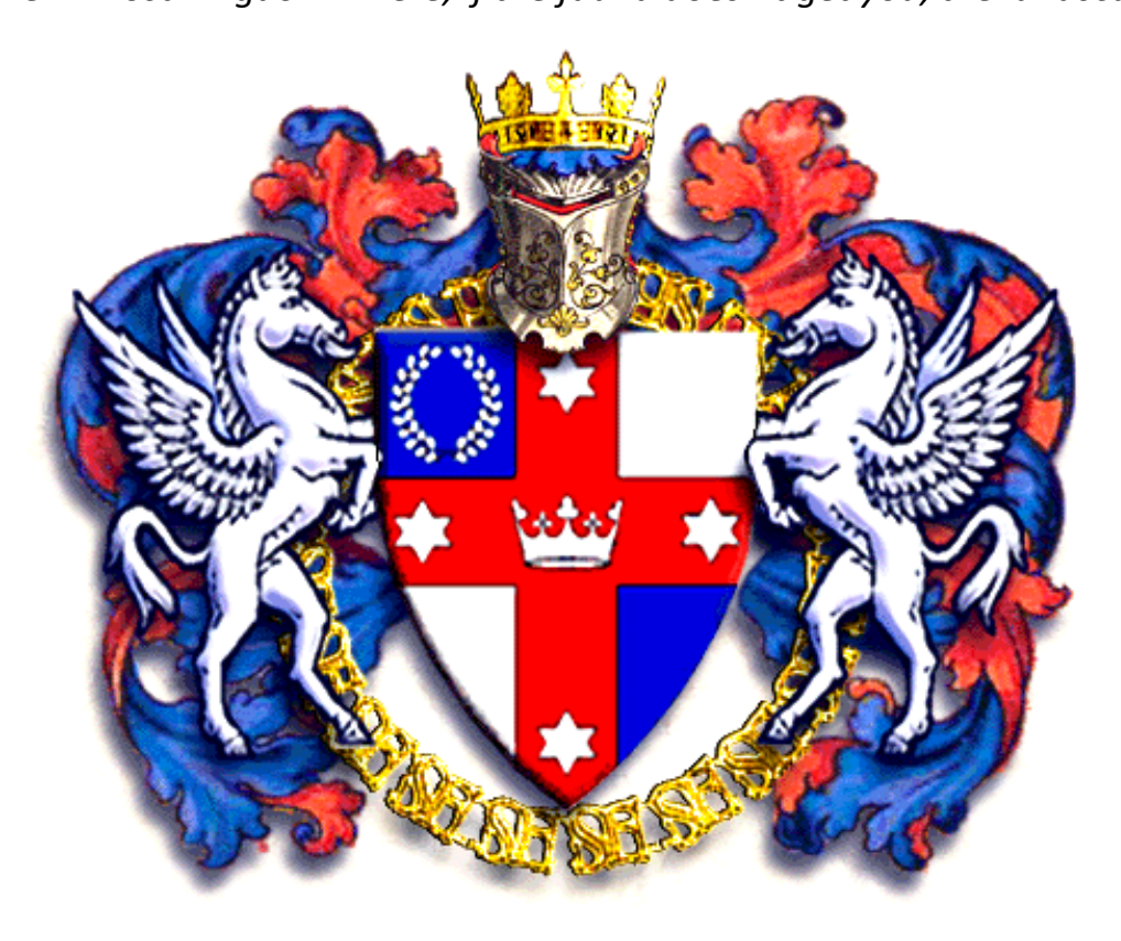
Figure 1: Rendering of the Lochac Kingdom Arms, incorporating the pegasi supporters, the Crown of Lochac, and the fealty chain of SF (Semper Fidelis). Image rendered by Mistress Roheisa Le Sarjent of Southron Gaard.

The Southern-most Kingdom where, if the fauna doesn't get you, the landscape will.