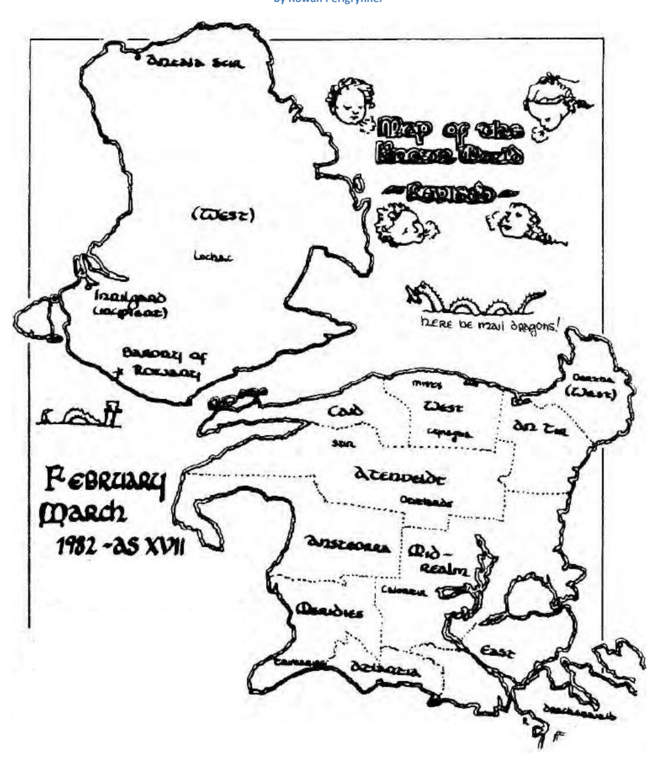
Figure 5: Map of the Known World (including Lochac) as published on the front cover of Runes issue 10, February 1983, by Rowan Perigrynne.

The first published map of Lochac was drawn around the time Lochac was proclaimed a Crown Principality and appeared in the 10<sup>th</sup> issue of Runes .